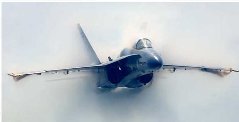
“Blue Angels” F-18

Morcom Has supplied a number of FSG-7016 radios to the “Blue Angels” since 2005. In addition, Morcom technicians have provided support during and after the warranty period. As a result, using this hardware has been a good match for the needs of the “Blue Angels”. Morcom is proud to be one of the suppliers of this very famous team.